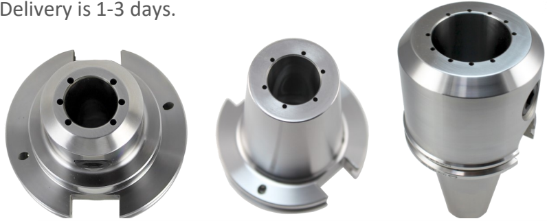
Examples of Jet-Blast for special applications:

We do the work @ PIONEER in Chicago, allowing us to alter any stock item. We add 2 coolant ports standard, special configurations available upon request and application. Delivery is 1-3 days.